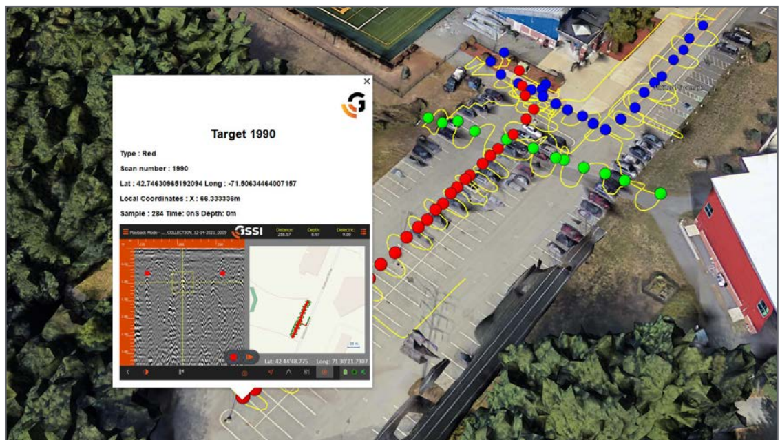
Image at right shows a water line (blue), sewer line (green) and an electrical line (red). The yellow line is the GPS track taken by the user.

UtilityScan software automatically saves a sample image (Target 1990 in the image below) for every target designated within the software. These in field targets can easily be exported into commonly available geo-browsers. These browsers can be used to create images for reports in the office or in the field.