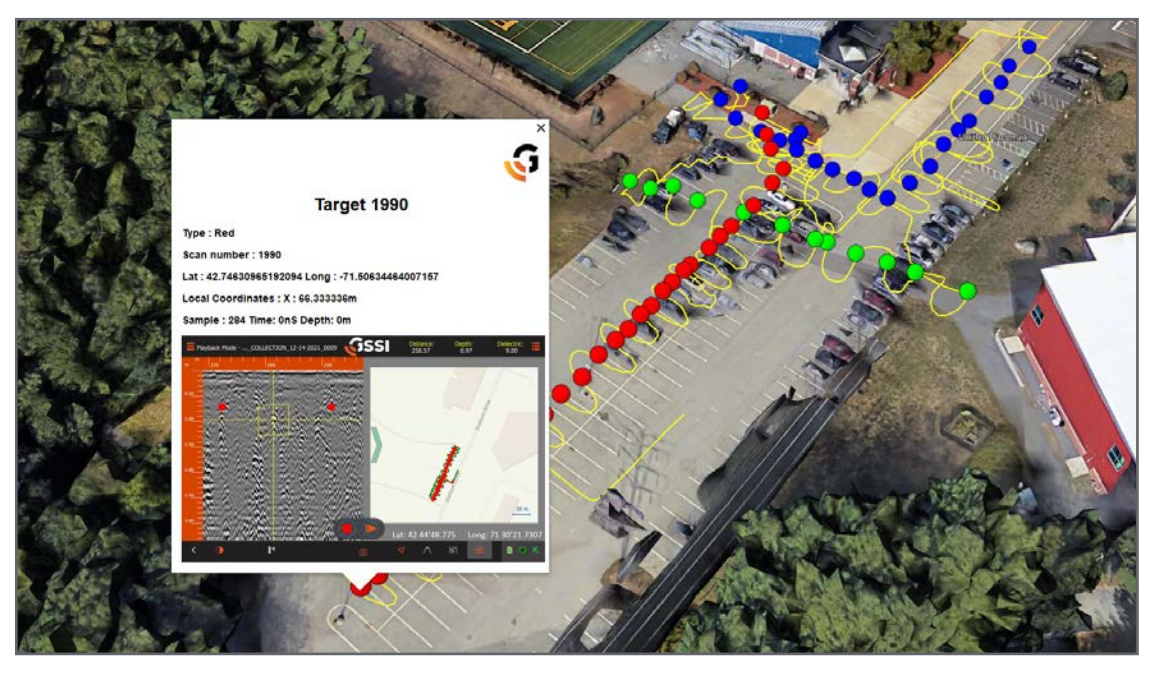
Image at right shows a water line (blue), sewer line (green) and an electrical line (red). The yellow line is the GPS track taken by the user.

UtilityScan software automatically saves a sample image (Target 1990 in the image below) for every target designated within the software. These in field targets can easily be exported into commonly available geo-browsers. These browsers can be used to create images for reports in the office or in the field.